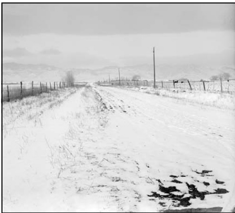
12300 South after a snowstorm, Jan. 1917