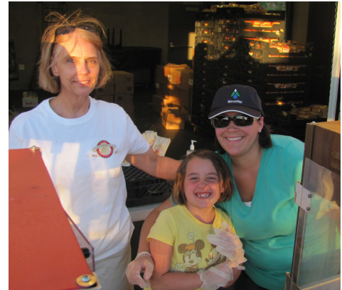
The "popcorn ladies" had a hard time keeping up with the demand!

In honor of the 100th anniversary this year of our culinary water system, we sponsored a free outdoor movie at the Draper Amphitheater on Thursday, July 14. Company employees cooked hot dogs and popped popcorn for attendees. In addition, we provided chips, bottled water, and cookies, all free of charge.