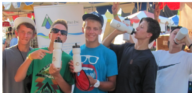
Staying cool at Draper Days

It was our way of saying thanks to the community that has supported us for more than a century. In return, our employees were impressed with the number of residents who stopped to say thanks to us. We're proud to be a part of this community.