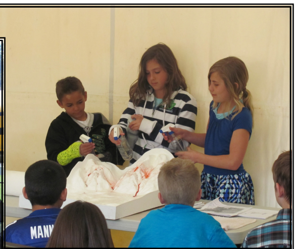
Students use a hands-on exhibit that demonstrates the importance of watershed protection.

For information on classes, visit conservationgardenpark.org .