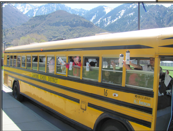
Fourth-graders display the water bottles they received as part of their Water Week observance.