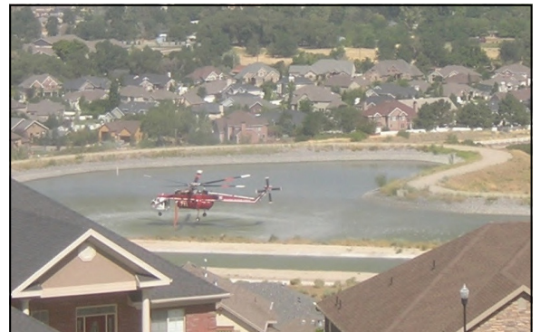
A helicopter airlifts water from the pressure irrigation pond near South Mountain golf course.

When a fire threatened homes in Draper on Sunday, August 7, firefighters were able to use water from WaterPro's pressure irrigation pond near South Mountain to help fight the flames.